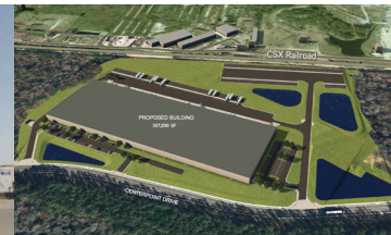
Virginia Port Logistics Park 340,000 SF