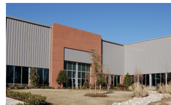
Virginia Regional Commerce Park, Bldg. A 60,000 SF