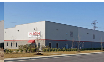
Suffolk Industrial Park 2000 Amedeo Court 40,000 SF