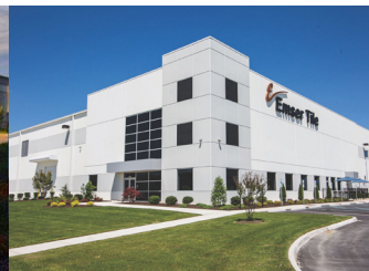
Emser Tile Eastern Distribution Center 400,000 SF