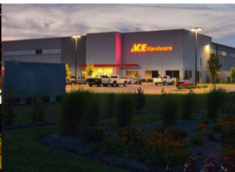
Ace Hardware Re-Distribution Center 474,000 SF