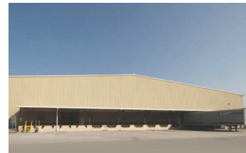
Commonwealth Commerce Center 40,000–80,000 SF