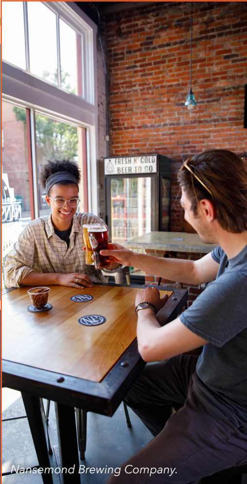
Nansemond Brewing Company.