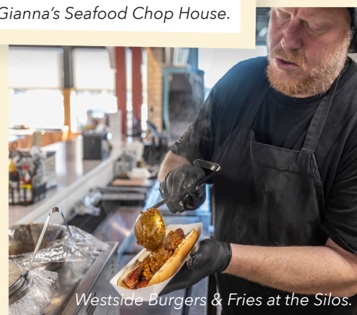
Westside Burgers & Fries at the Silos.