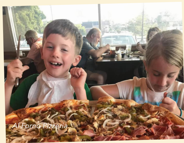
Al Forno Pizzeria