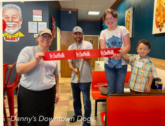
Danny's Downtown Dogs.