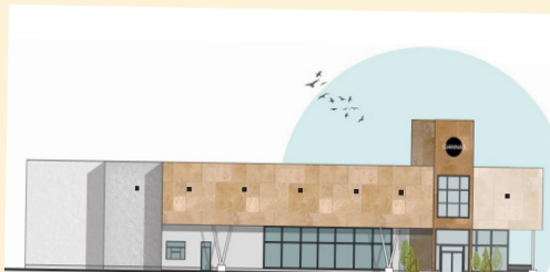
Rendering of Gianna's Seafood Chop House.