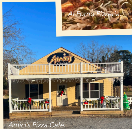
Amici's Pizza Café.